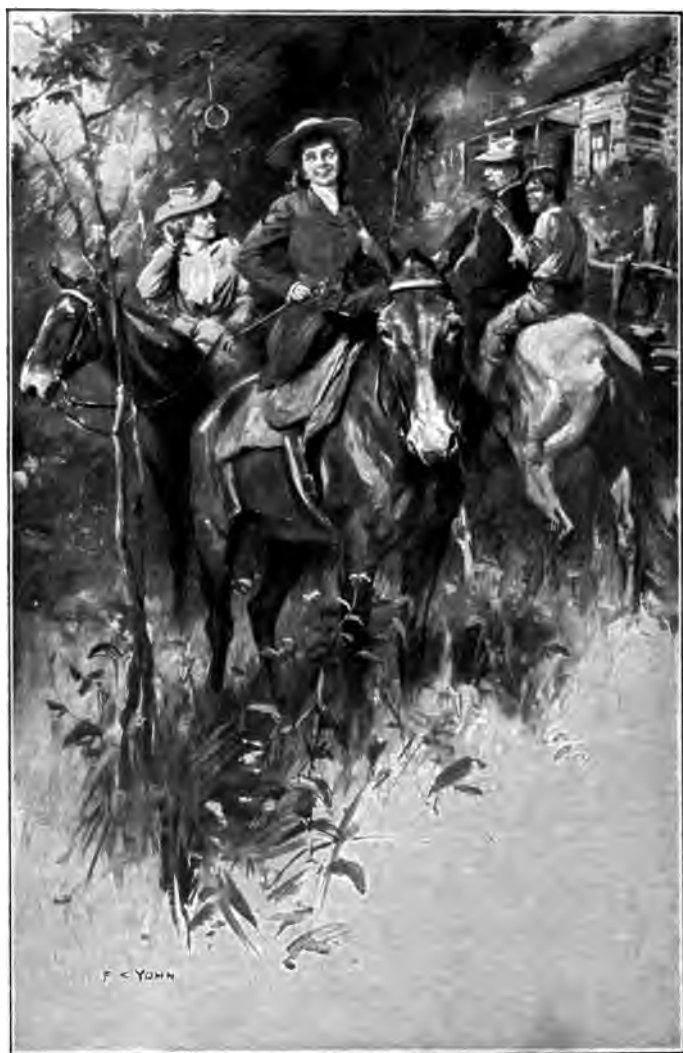
“Mart’s a-gittin’ ready fer a tourneyment.”